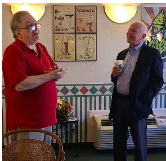
The two AJs in person, finally!